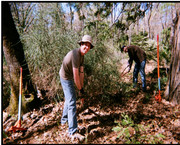
Volunteers at work

Broom Education and Eradication Program (BEEP) is a Forest Ranch community action group formed in December, 2006 for the purpose of controlling broom infestations in the community. Forest Ranch is a foothills community and therefore concerned about fire danger. Since broom increases the threat of fire, removal is a high priority. BEEP has become an affiliate of the Big Chico Creek Watershed Alliance .