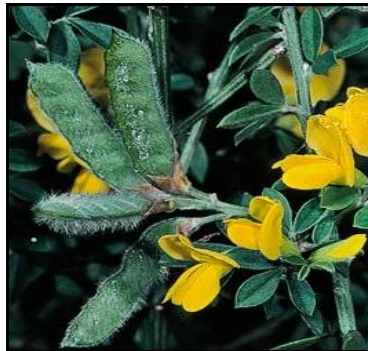
French Broom seed pods

The broom seeds are dispersed several feet from the plant and their hard coats enable them to travel down waterways and in tire and shoe treads. They can germinate after 15 years or more. For example, broom seeds along Highway 32 in Forest Ranch can wash down ravines into Big Chico Creek and germinate 10 years later in a gravel bar in Lindo Channel.