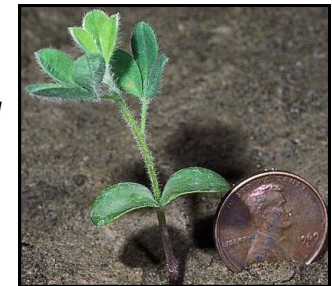
French Broom Seedling

Seedlings: Seedlings will appear after the winter rains. These can be pulled by hand or sprayed carefully with glyphosate (e.g.: Roundup™). Since broom seed banks are long-lived, plan on being vigilant for several years.