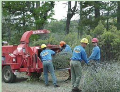
Chipping in Butte County

Regional RCD's have negotiated a solution to the Attorney General's Prop. 40 CFIP funding freeze by banding together and highlighting their special legislative authority in Division 9 of the Public Resources Code. The new partnership created by the Sierra Coordinated Resources Management Council includes 15 RCDs and Cal Fire (CDF). The partnership will rank and fund approximately $6 million of forest stand improvement cost share projects over the next 5 years. Contracts will be awarded directly to private property owners and will focus on watershed management and forest health.